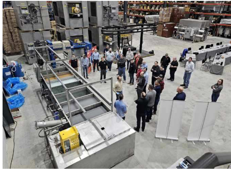
The facility in Wisconsin.

BASF | Chemetall cares deeply that their customers stay up to date on the ever-evolving increases in sustainability in equipment design and corresponding chemistry, so they frequently provides comprehensive customer training.