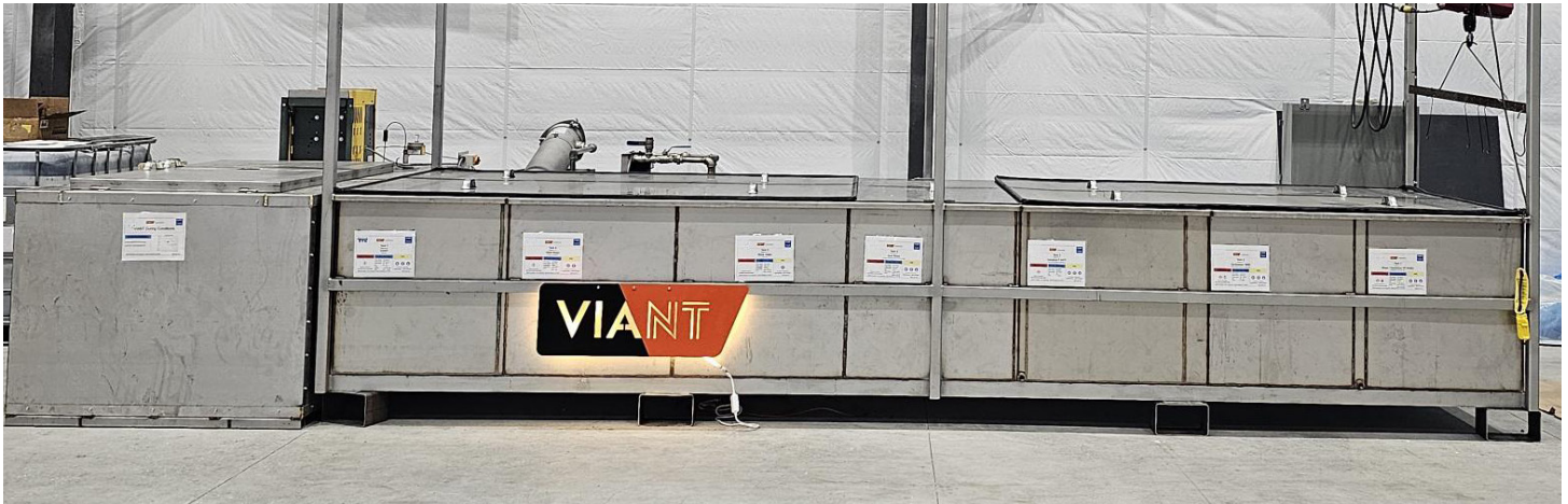
Powder paint with electrostatic spray guns.

BASF | Chemetall experts are always pleased to teach customers and attendees in maximizing the efficient use of their products and services.