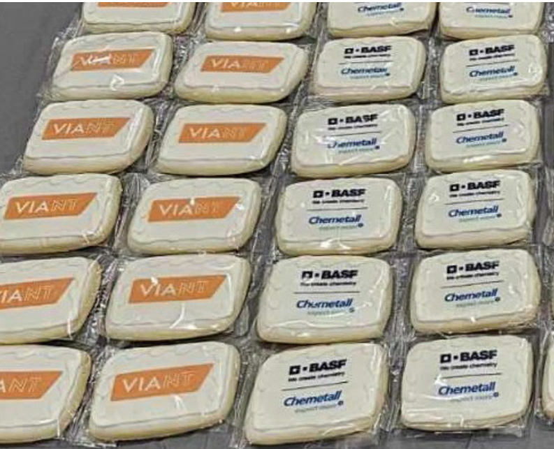
Lots of cookies!

BASF | Chemetall is known as the Surface Treatment global business unit of the Coatings division of BASF, supplying state-of-the-art cleaning, pretreatment, system optimization, and VIANT. BASF | Chemetall provides both innovative chemistries and expert attention to process efficiency for metal, plastic, glass, and composite substrates for a vast range of industries and end markets.