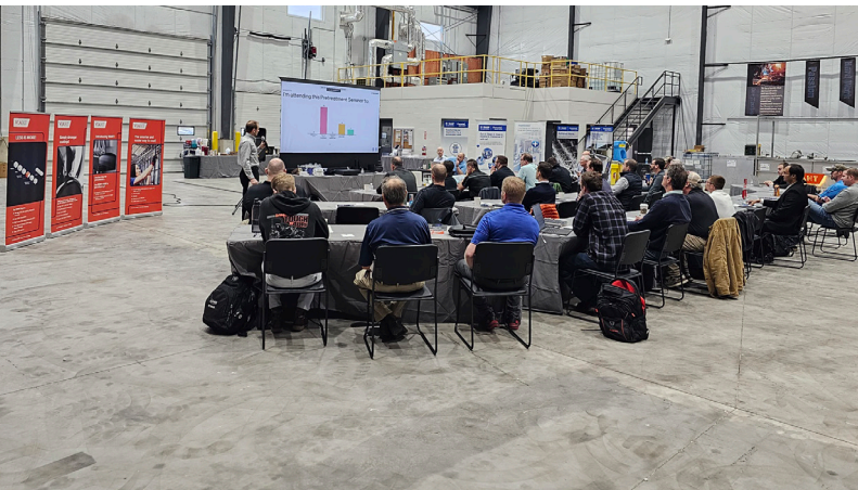
Power Point Presentations on cleaning, pretreatment, system optimization, and VIANT.