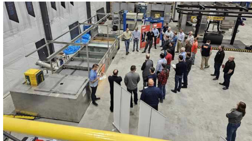
Interactive sessions during live demonstrations.

VIANT is a conversion coating and primer paint in a single coating layer. It provides reliable corrosion protection on edges and inner surfaces and is the smarter and easier way to coat. VIANT is sustainable, has a lower carbon footprint, uses less water and consumables, and is low VOC. VIANT is simple to apply without high voltage, new equipment, or intensive training; all with easy bath control. VIANT is effective, has higher edge control, and is homogenous on inner surfaces. VIANT is efficient, lowers cost of ownership, reduces energy use, and yields an outstanding performance on edges and inner surfaces.